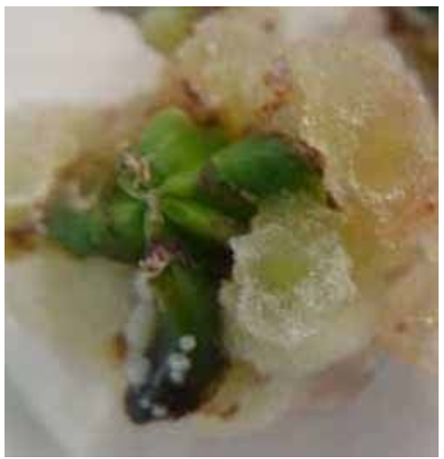
Fig. 1. The callus of C. peruvianus var monstrosus in spring season