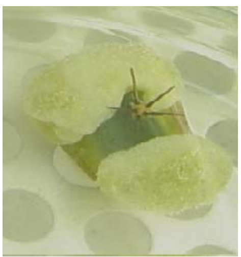
Fig. 2. The callus of C. peruvianus var tortuosus in spring season