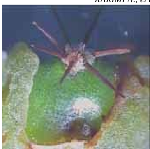
Fig. 4. The callus of C. peruvianus var tortuosus in summer season